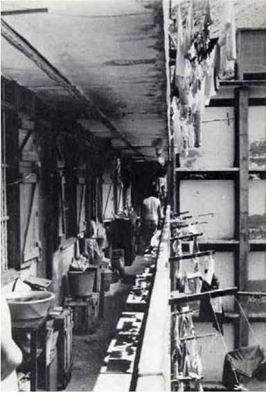
Figure 5: Mark II Shared Corridor