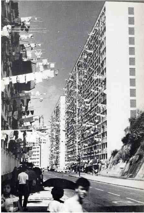
Figure7: 15 storey, Mark V: clothes-drying poles

programme and an administrative process”, a bureaucracy predictably proud at having moved hundreds of thousands of squatters into new housing. Life for the resettled residents of the housing projects, however, is somewhat more complex: The resettlement estates, for example, were often far away from the original squatter villages, thus breaking up social networks, employment opportunities and children’s schooling with the move.