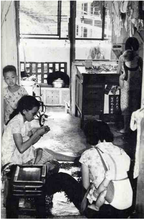
Figure 9: Mark I Apartment: doors-open

flowing from ‘inside’ to ‘out’ (fig. 9, 10), Pruitt-Igoe residents described the danger zone for children beginning right outside the apartment door 33 . This presents a clear linkage between lack of collectivity, and the condition of these public spaces. Individuals experiencing this disparity become terrorized by the inability to have their personal values and aspirations reflected in the collective environment.