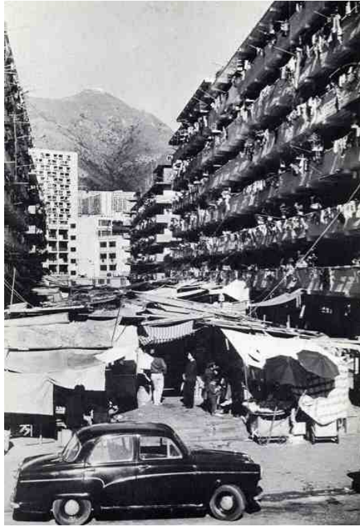
Figure 10: Mark I: high rise street life

In Hong Kong, the story by many accounts is a success. By 1964 the ultra-basic 7 storey Mark I and II models still in full use, were replaced for continuing development by the 16 storey Mark IV with plumbing, lighting and elevators 34 (fig. 7). For the Hong Kong Administration, the resettlement program was seen as a victory “both as a building