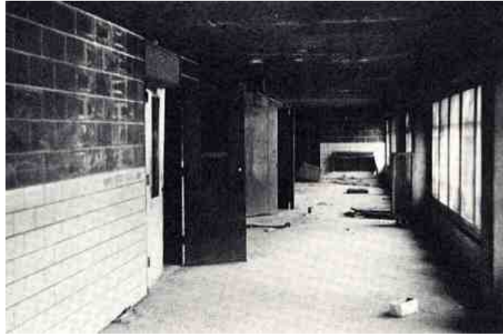
Figure 6: Pruitt-Igoe Shared Galleries, conceived as "indoor streets"