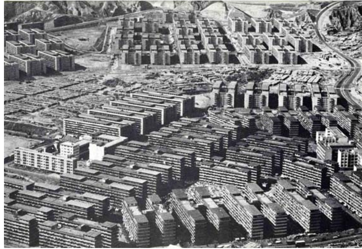
Figure 4: Mark I + II estates, housing +/-150K resettled squatters,1966

Hong Kong in the 1950's, like St Louis, also faced a housing crisis. Hundreds of thousands fleeing China had arrived on the shores of Hong Kong, and with no hope of finding existing housing, had squatted illegally on hillsides, ravines and any other unoccupied bits of land; constructing shanty-towns of whatever materials they could scavenge ( figure 3 ). The land being scarce, these villages were often extremely dense, with little air circulation or light, and virtually no basic services 27 . With no end in sight to this tide of immigration, Hong Kong's newly formed "Department for Resettlement" began a policy of eviction and relocation, along with a design and construction program at a feverish pitch. Between 1954 and 1969 the Public Works Department had designed and constructed 477 multi storey housing blocks containing 221 581 rooms. 28 The earliest buildings, Mark I and II, were extremely basic 7 storey concrete slab constructions, with no plumbing or electrical service to the apartments. Each building with between 56 and 84 rooms, had 6-12 shared outdoor flush latrines and two water taps. With no elevators, buildings were entered using exterior staircases, and access to