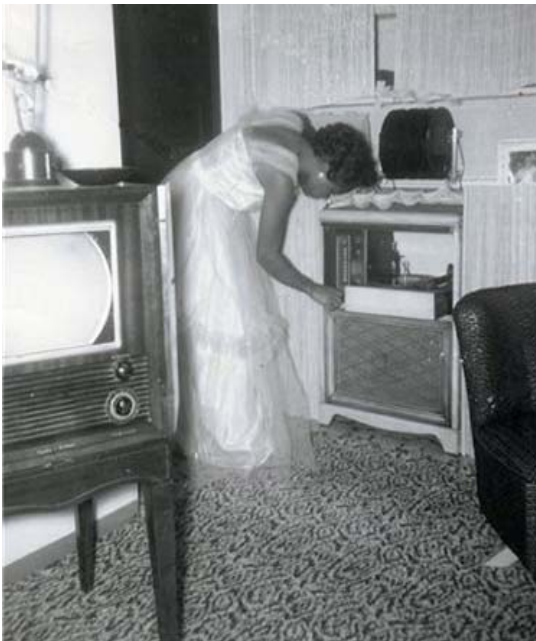
Figure 7: Pruitt Igoe Interior c. 1960

The desperation, and resignation of the voices of so many of the residents interviewed reveals a sense of powerlessness over their environment, but particularly in the social relationships that define it. Although physical space clearly played a role in these relationships, the powerlessness seems to be located in the lack of alignment between personal values, the expectations of each 'other', and the actual values and occurrences that surround them and join them into a community.