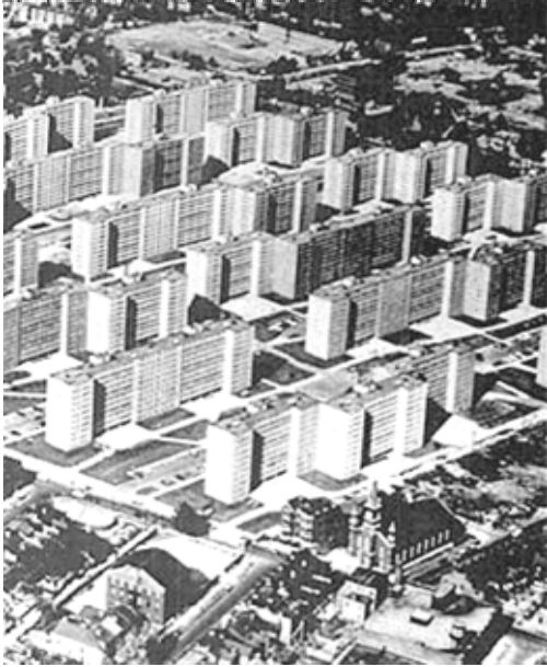
Figure 1: Pruitt-Igoe 1955