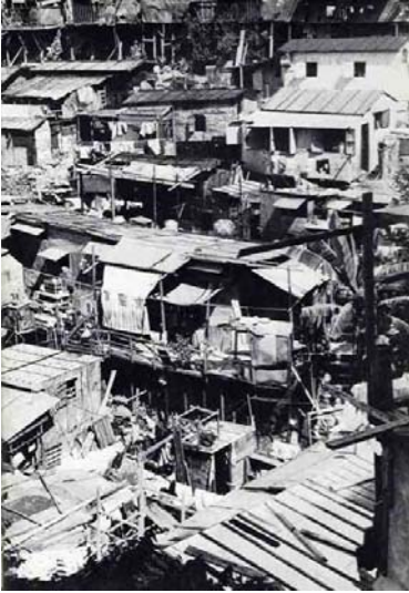
Figure 3: Squatter's Housing c.1966