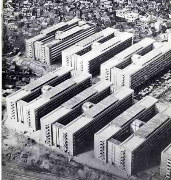
Figure 2: Mark II estates, Hong Kong c.1955

Although by the time of implementation a disturbing number of its original features had suffered budget cuts, early images and accounts describe orderly efficient apartments of varying sizes for different family configurations with plenty of natural light, air and all the conveniences of modern urban life. However, the thousands of personal stories that make up the lived experience are far less clear-cut than the evenly spaced slab apartments standing regimented in the urban fabric of St. Louis. What is known, is that in the 18 years that these buildings stood, the quality of life for the residents steadily declined, from optimism and faith in a brighter future, to despair, entrapment, and fear for the lives of their families. The physical environment reflected these feelings with broken windows, trash-filled hallways, graffiti and vandalism. By 1972, things had become so bad that despite several attempts, protests and formal proposals to save the projects (some which in retrospect seem enormously reasonable) the entire project was slated for demolition—the physical form of the building sentenced to death and erasure. On July 15, 1972 Pruitt-Igoe was dynamited to the ground and the site cleared once again.