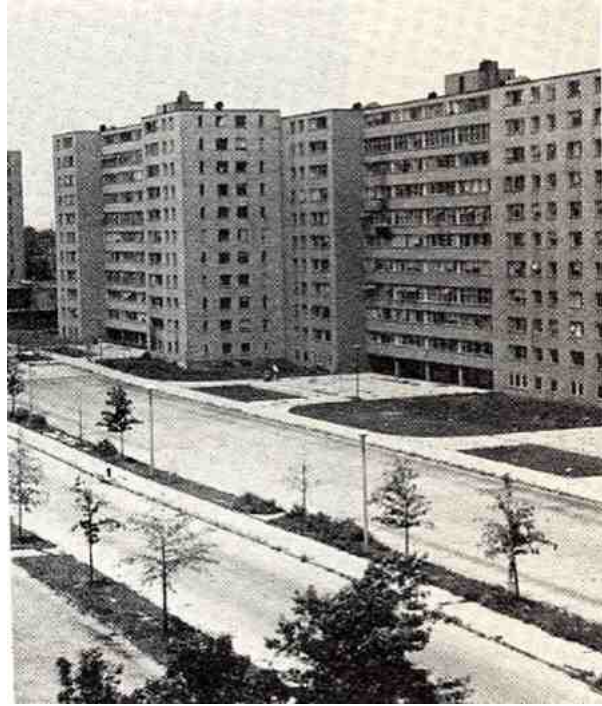
Figure 6: Pruitt-Igoe: broken windows

While less than 40% of squatters welcomed the relocation into the estates, 82% of the relocated residents indicate that they are happy with their new housing; In spite of the fact that 68% of the residents had “potted plants in their private quarters”, many other metrics of well-being, such as economic conditions, hygiene and health had not measurably improved since moving. This also correlated with the fact that the majority of residents did not indicate that they were any more or less happy in general after moving into the mass housing estates. 35 Despite severe over-crowding and extremely poor